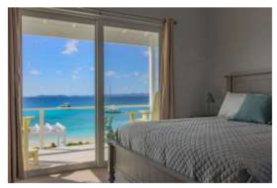
One master bedroom and one bunk room in main building: